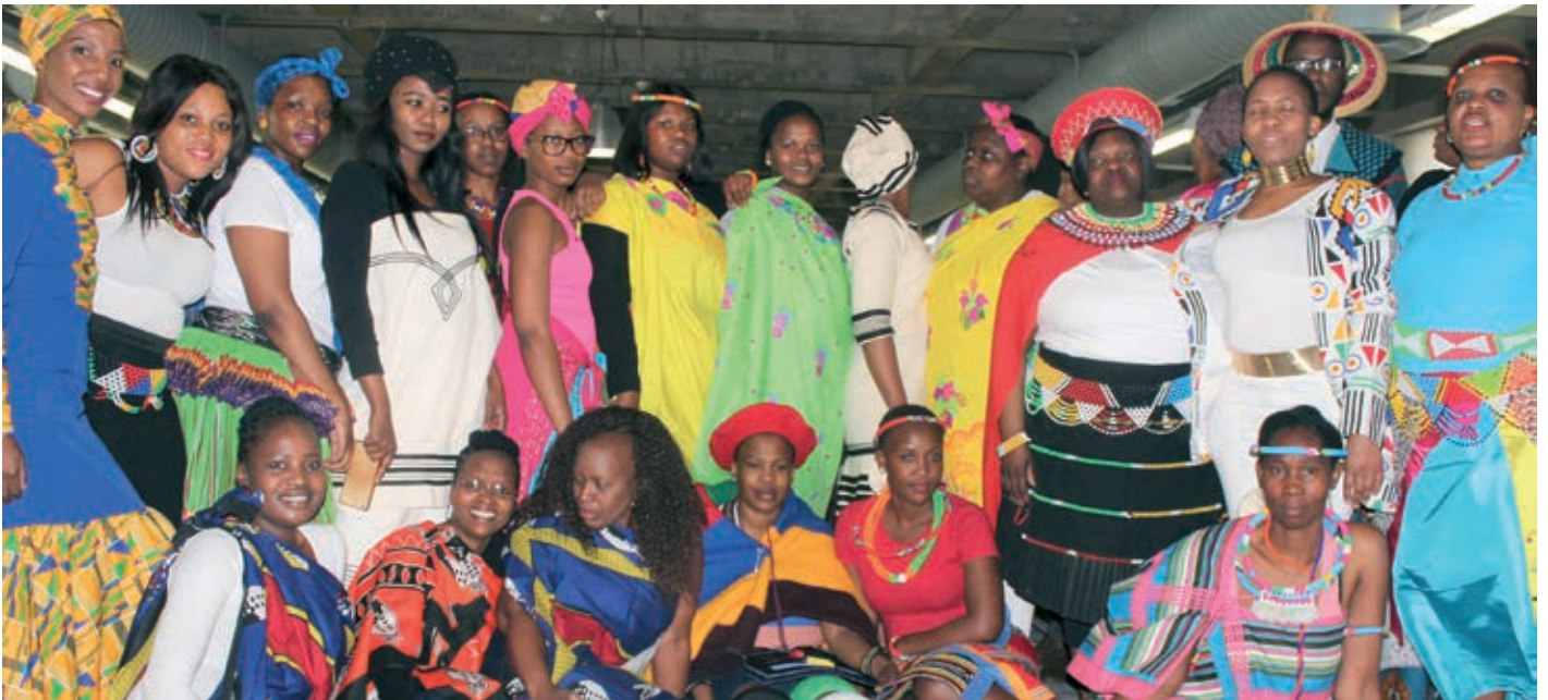
Winning team - Airfreight Import

Future Leaders thank all who participated for their enthusiasm in sharing the beauty of their cultures and traditions over this Heritage Month. Maz'enethole nto zakuthi. Makwande! Nangamso! (meaning thank you all for participating, may you do even more in the future).