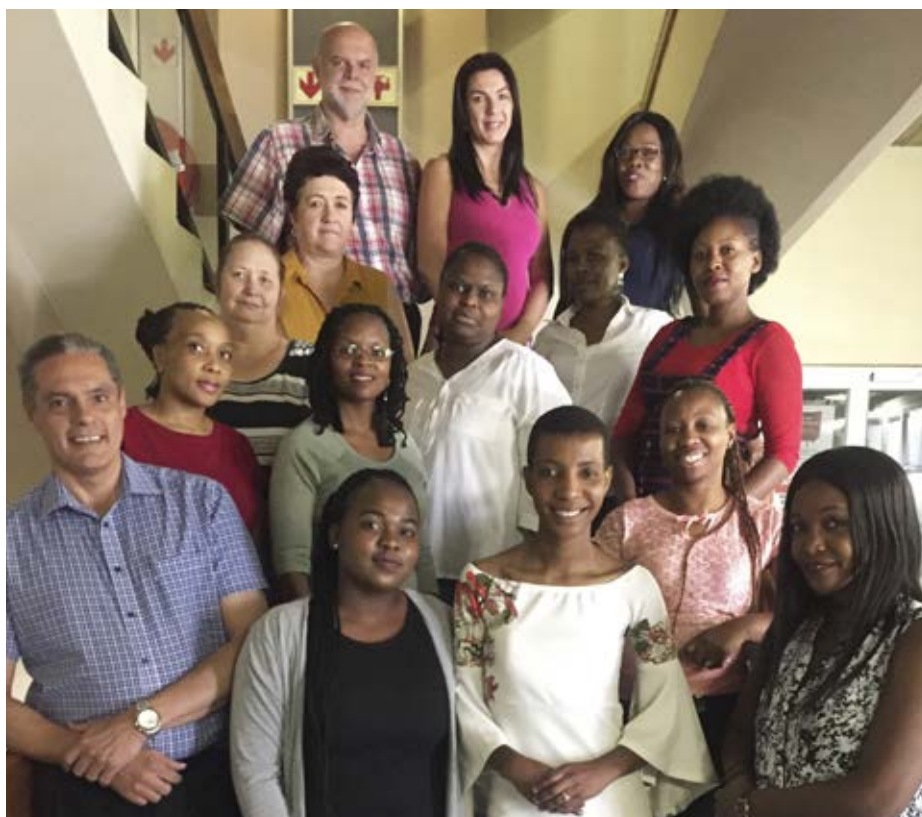
Air Import Channel Controllers.