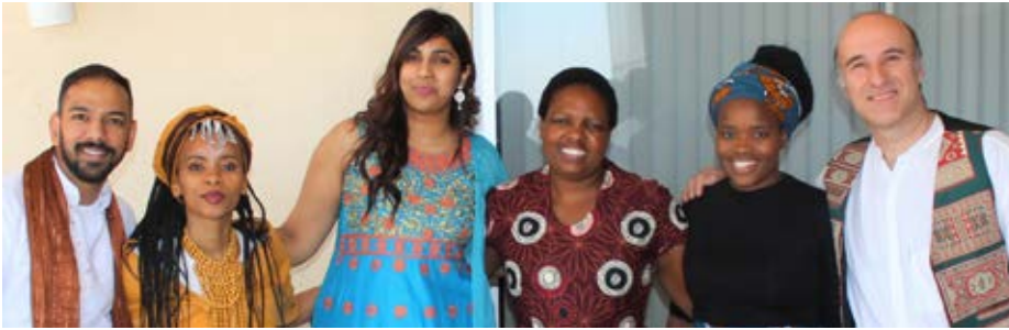
JNB Future Leaders Heritage