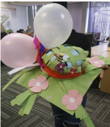
1st place Shanley Dube, for the most creative hat.

Hat Day on 15 September brought out lots of creativity at Wrench Road, getting staff interactive and lifting spirits. About 15 staff members participated and we had three winners.