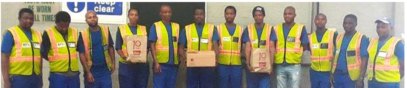
The Bidvest International Logistics Jacobs staff were awarded meals in recognition of all the good work done and performance over the past month. Well done team.