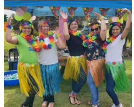
Bidvest International Logistics staff made a great effort on the day and won the Best Tee award.

A large donation was also made to the Algoa Bay Council for the Aged and will be used for a new water tank system at their Cuyler Home facility in Port Elizabeth. Lastly, all guests at the event heeded a call for support for our third charity, Isithembiso Babies Home, and raised seven times our expected donation on the night. This was only possible due to the amazing generosity of our Bidvest VIP executives, guests, staff, clients and sponsors.