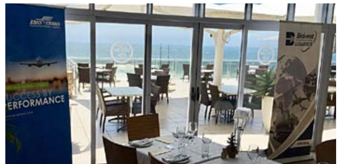
The beautiful setting for the Bidvest International Logistics East London function.